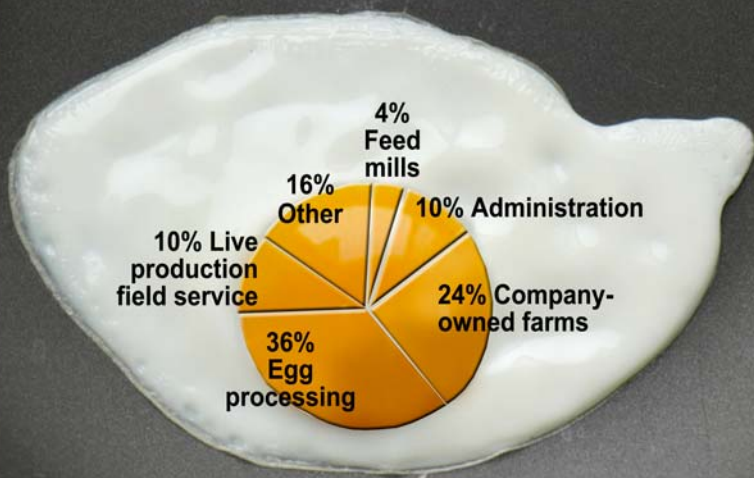
Employment in the Texas Egg Industry