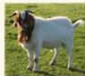
Male goats: Bucks