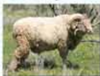
Male sheep: Rams