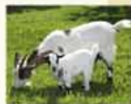
Female goats: Does