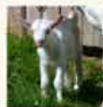
Young goats: Kids