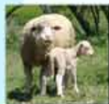
Female sheep: Ewes