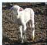
Young sheep: Lambs